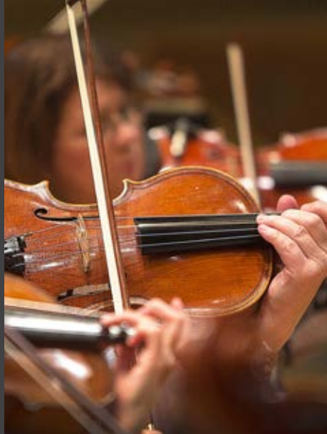
Indianapolis Chamber Orchestra