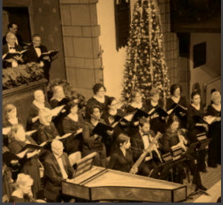
A Baroque Christmas